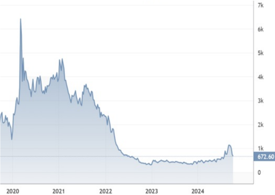
MBA Mortgage Refinance Index