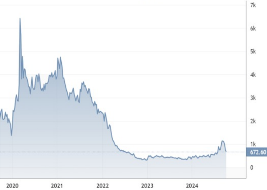
MBA Mortgage Refinance Index