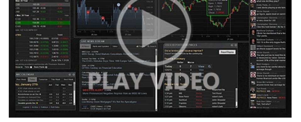
Watch the Video