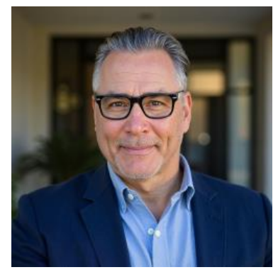
Todd Anthony Snyder

It's impressive and telling that yields hit levels by 10:40pm ET that were right in line with where they would go on to end the following trading day. This was not a matter of financial markets guessing or speculating. It was a reflection of their efficiency and their constant quest to operate on the fastest possible timeline with the greatest possible precision.