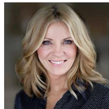
Christina "Demo" Realtor

Managing Partner, Real Estate Company, LLC.