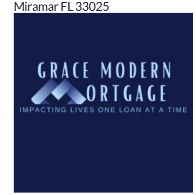
Grace Modern Mortgage

www.gracemodernmortgage.com P: (954) 945-8694 11820 Miramar Parkway