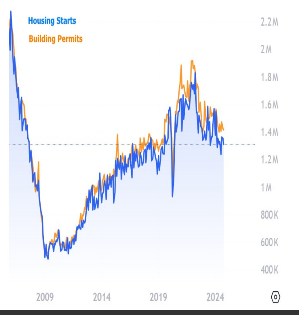
© MBS Live, LLC. All rights reserved. This newsletter is a service of MBS Live.

Neither measurement stands out on a longer term chart. Both have dialed back from the long-term highs seen between late 2020 and early 2022, but both remain in strong territory relative to 2019. This is the first way to view the slowdown in construction.