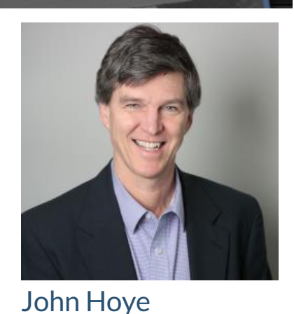
HoyeHomeTeam -Berkshire Hathaway Agents www.hoyehometeam.com