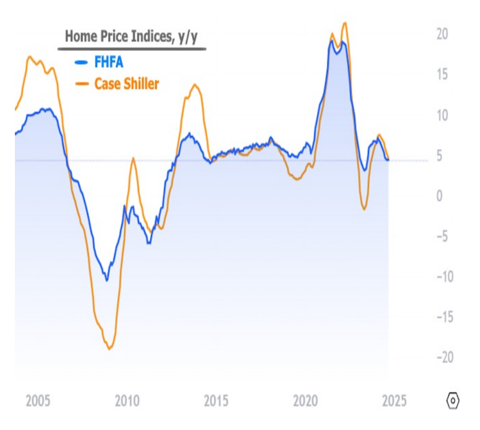
What are the implications for conforming loan limits, and what even is a conforming loan limit (CLL)?

The more volatile Case Shiller data declined by 0.3% in September while FHFA's broader data set showed 0.7% growth. These discrepancies aren't uncommon. Moreover, both are reflecting a mid-4% rate of appreciation in annual terms.