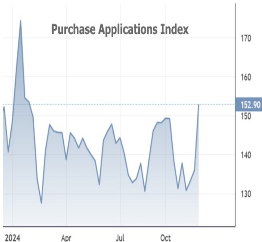
Purchase Applications Index

As has been and continues to be the case, there's an obvious counterpoint to any of these periodic surges: the broader context. In other words, yes, these are the highest levels since February, but even if we go back to February 2023, the range since then is historically low and sideways.