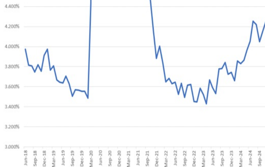
Unemployment Rate, Unrounded

It would be fair to point out that 4.2+ is still a historically low unemployment rate, but just as fair to point out that the unemployment rate tends to move with a sort of glacial momentum that rarely changes course abruptly.