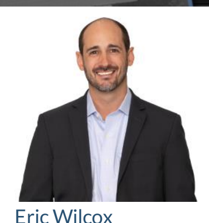
VP Business Development, CTC Mortgage Company

https://www.ctcmortgage.com/ P: (561) 507-1984 M: (561) 853-6929