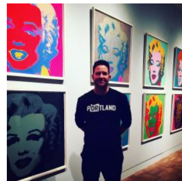
Mortgage Broker, Promise Home Loans

Notably, MBA's weekly survey data only shows rates declining from 6.69 to 6.67, but MND's daily rates tell a different story with a drop from 6.88 to 6.68. That 0.20% decline would certainly be enough to account for the jump in activity, especially in a market where the outright activity is so historically low.