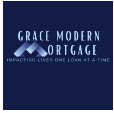
Grace Modern Mortgage

www.gracemodernmortgage.com P: (954) 945-8694 11820 Miramar Parkway