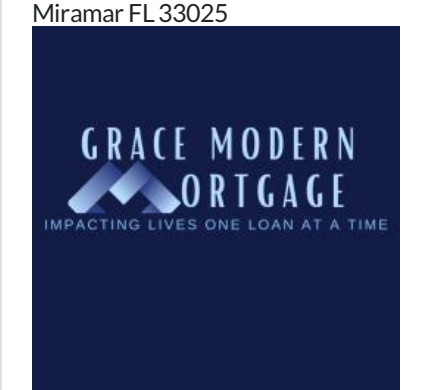
Grace Modern Mortgage

www.gracemodernmortgage.com P: (954) 945-8694 11820 Miramar Parkway