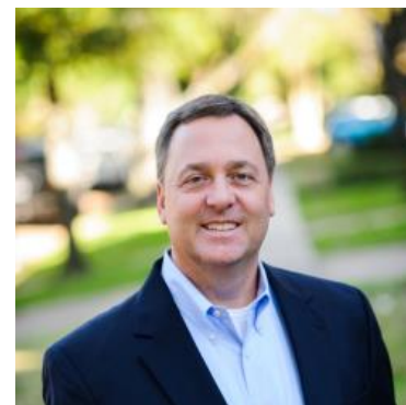
Paul E Smith

Today's dot plot showed the median Fed member sees much higher rates by the end of next year compared to the last dot plot 3 months ago. The following chart shows the new dots in blue and old dots in red. The year to focus on is 2025. Note the migration upward from the low 3 to high 3 percent range.