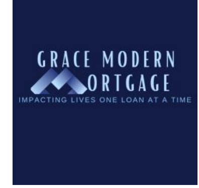
Grace Modern Mortgage

www.gracemodernmortgage.com P: (954) 945-8694 11820 Miramar Parkway