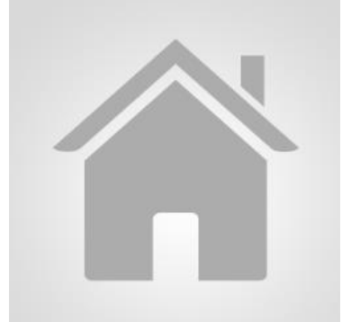
Jeff Ball Visio Financial Services Inc. 1905 Kramer Lane Austin TX 78758-___

It's also true that adding 1 to 1 is a 100% increase while adding 1 to 100 is only a 1% increase.