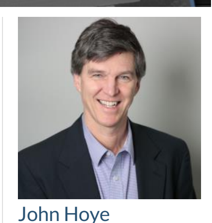
HoyeHomeTeam Berkshire Hathaway Agents www.hoyehometeam.com