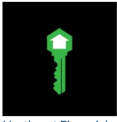
Northeast Financial LLC

www.northeast-mortgage.com P: (844) 788-7237 48 Meriden Rd, Suite 1