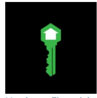
Northeast Financial LLC

www.northeast-mortgage.com P: (844) 788-7237 48 Meriden Rd, Suite 1 Middlefield CT 06455 NMLS# 117273