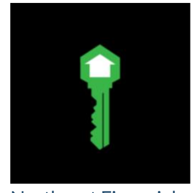
Northeast Financial LLC

www.northeast-mortgage.com P: (844) 788-7237 48 Meriden Rd, Suite 1 Middlefield CT 06455 NMLS# 117273