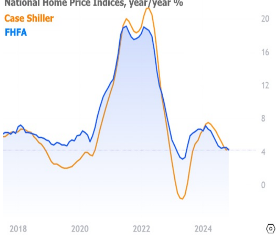
National Home Price Indices, year/year %

As seen in the table above and the chart below, prices are easily in positive territory in year-over-year terms. The same is true for FHFA, which is seeing almost the exact same change as Case Shiller. In addition, both indices have been fairly flat in the low 4% range recently.