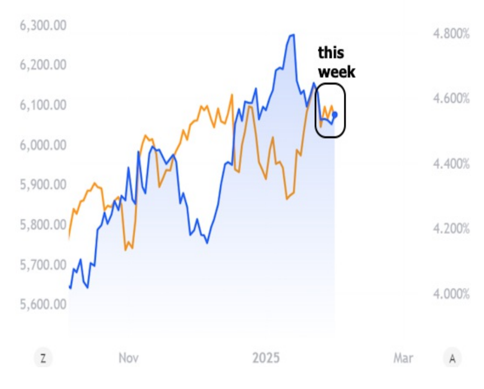
Still, tariffs are a hot topic of conversation. So what do we know?

First off, we don't yet know exactly how they'll look. Even though the White House said it would roll out 25% tariffs on both Mexico and Canada on Saturday, there are questions as to how sweeping the implementation could possibly be in light of current laws and the interpretation of the Emergency Economic Powers Act (which Trump claims permits him to impose sweeping tariffs, although some legal scholars say it could be challenged in court).