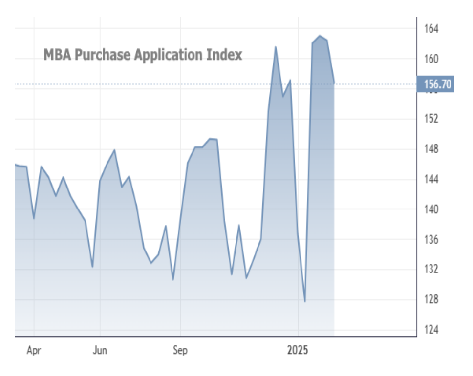
Here too, broader context changes the takeaway.

Purchase applications are never as sensitive to rates over short time horizons. In fact, they moved down a bit last week, but the counterpoint is that the purchase index has been holding near recent highs.