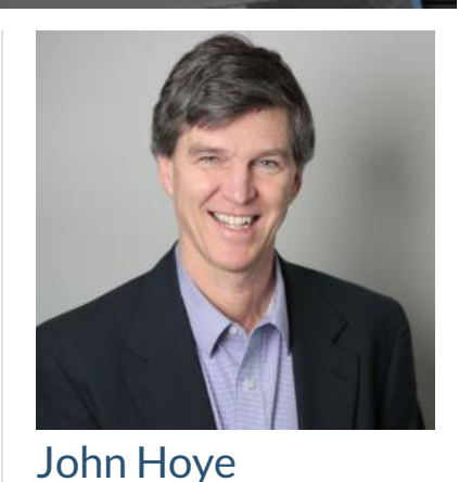
HoyeHomeTeam -Berkshire Hathaway Agents www.hoyehometeam.com