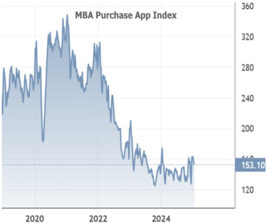
MBA Purchase App Index

Here's a breakdown of this week versus last week in several categories of loans in terms of market share: