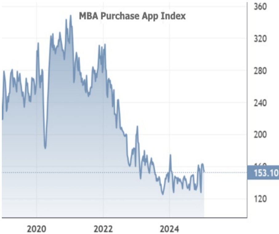
MBA Purchase App Index

Here's a breakdown of this week versus last week in several categories of loans in terms of market share: