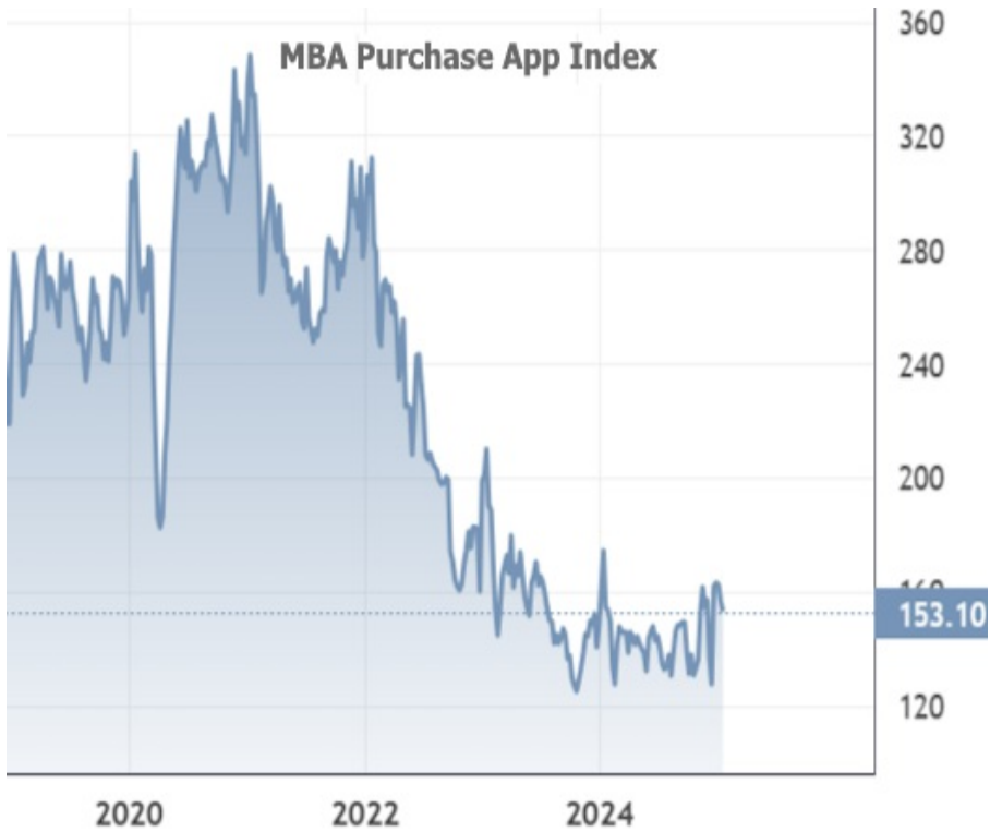
MBA Purchase App Index

Here's a breakdown of this week versus last week in several categories of loans in terms of market share: