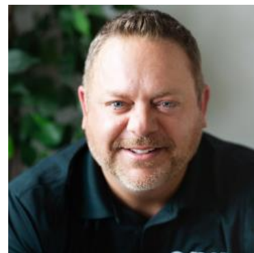
Owner & Mortgage Broker, Verasol Lending Solutions

The uptick makes sense in light of the mortgage rate situation last week. Rates had been inching slowly to the lowest levels in almost 2 months as of Monday morning. Wednesday brought a noticeable drop and there wasn't much of a bounce for the rest of the week.