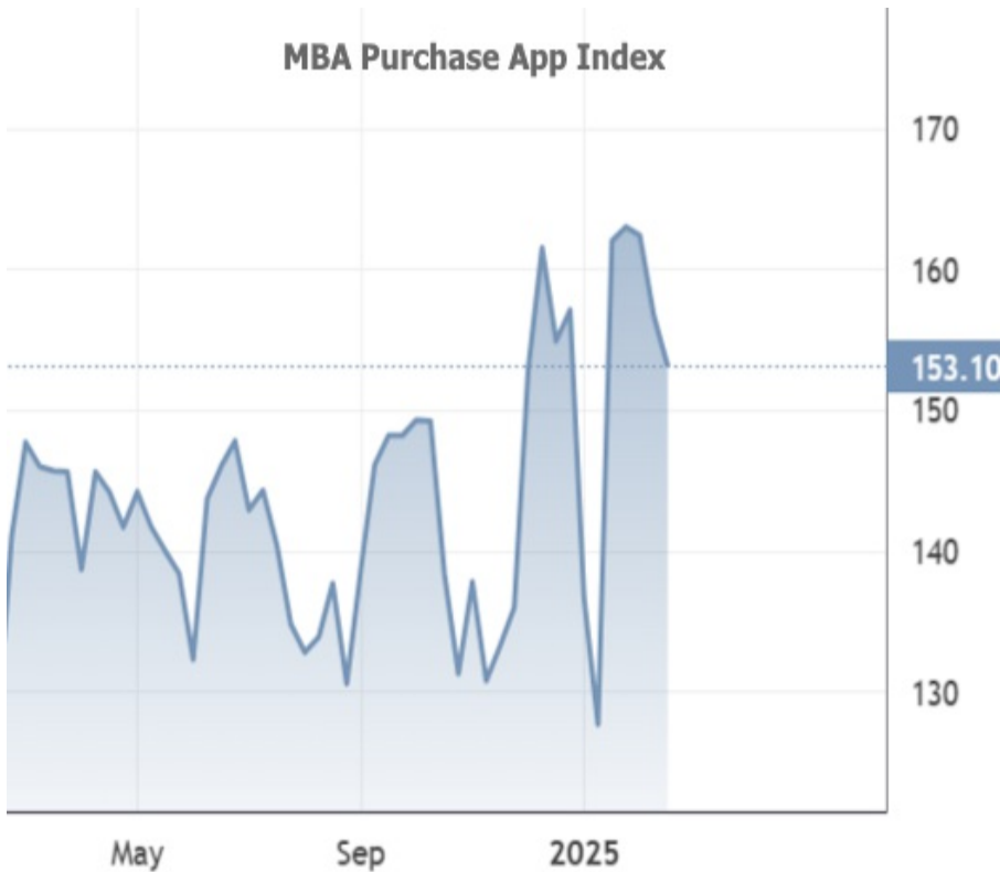
MBA Purchase App Index

In the bigger picture, purchase applications suffer from the same jarring adjustment experienced across the housing market with the epic rate spike in 2022.