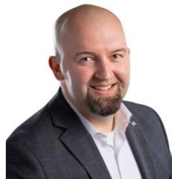
Vice President | Broker, Neighborhood Mortgage Group

The uptick makes sense in light of the mortgage rate situation last week. Rates had been inching slowly to the lowest levels in almost 2 months as of Monday morning. Wednesday brought a noticeable drop and there wasn't much of a bounce for the rest of the week.