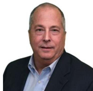
Mortgage Loan Originator, SunnyHill Financial

The uptick makes sense in light of the mortgage rate situation last week. Rates had been inching slowly to the lowest levels in almost 2 months as of Monday morning. Wednesday brought a noticeable drop and there wasn't much of a bounce for the rest of the week.