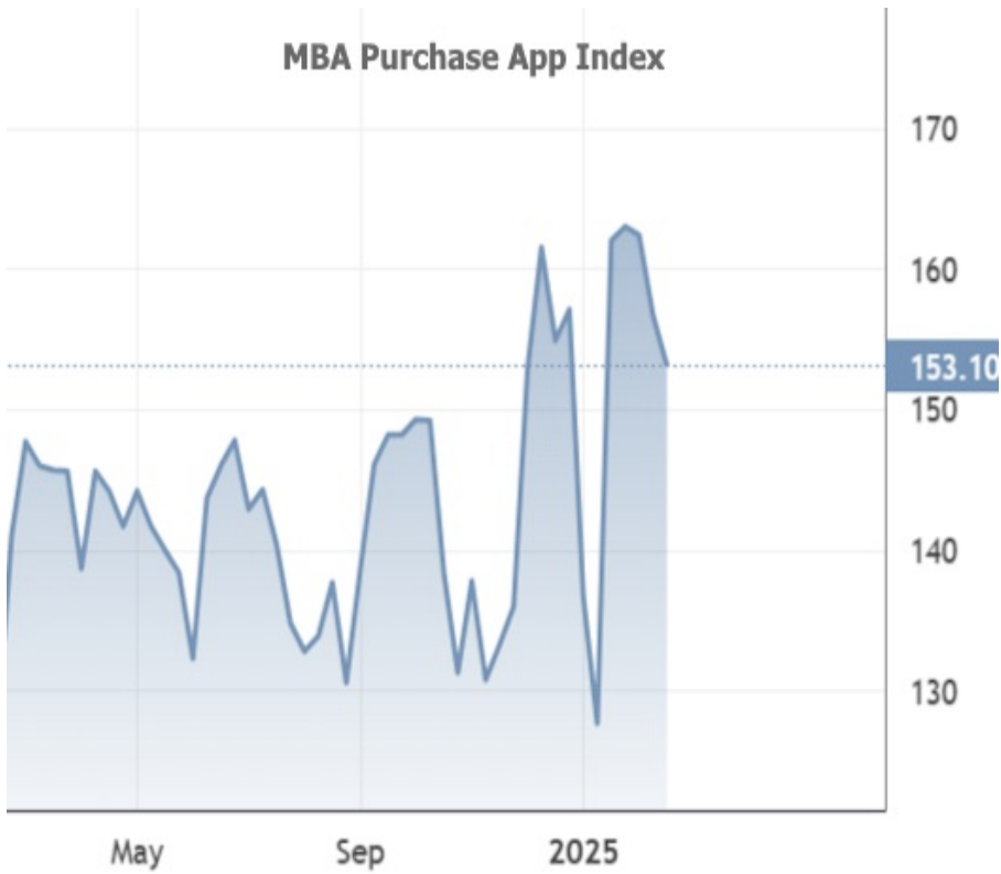
MBA Purchase App Index

In the bigger picture, purchase applications suffer from the same jarring adjustment experienced across the housing market with the epic rate spike in 2022.