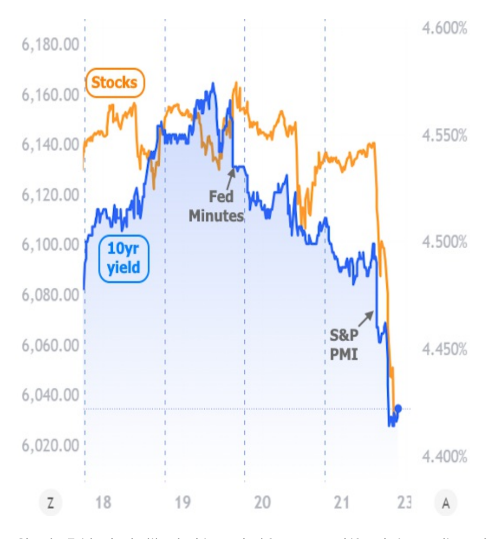
Clearly, Friday looks like the bigger deal for rates and if we bring trading volume into the conversation, the PMI data looks like the bigger deal.