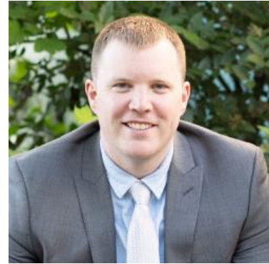
Stephen Heston Broker NMLS #1930964, Aspire Mortgage Solutions LLC NMLS #2481498

Even if we look at the super noisy month-to-month readings, we can still see both indices bouncing around the historically normal mid-point like a well-behaved EKG. Granted, Case Shiller's EKG rhythms are a bit wider than normal, but this is always the more volatile of the two series.