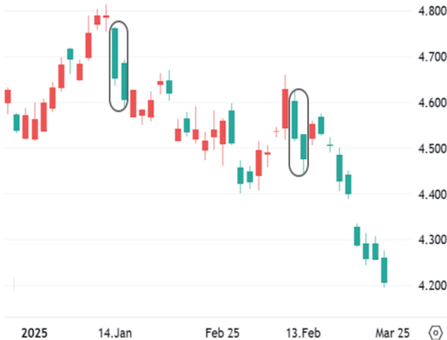
10 Year Treasury

The chart makes it easy to see that January 15th and February 13th kicked off 2 of the biggest winning streaks for rates. Both dates mark surprisingly low inflation readings. Simply put, rates care a lot about inflation and when inflation is lower than expected, rates drop.