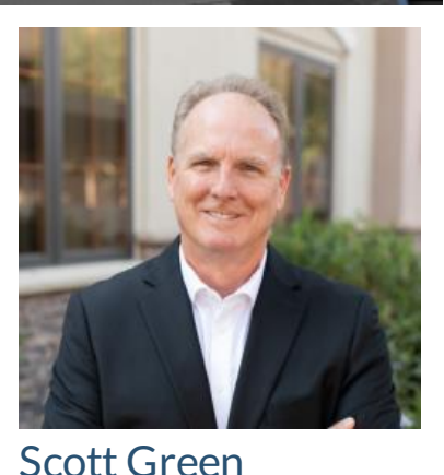
Home Loan Consultant, Monument Mortgage Group