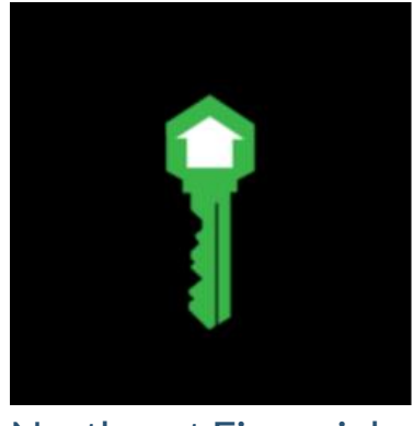
Northeast Financial LLC

www.northeast-mortgage.com P: (844) 788-7237 48 Meriden Rd, Suite 1 Middlefield CT 06455 NMLS# 117273