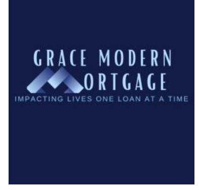
Grace Modern Mortgage

www.gracemodernmortgage.com P:(954) 945-8694