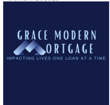
Grace Modern Mortgage

www.gracemodernmortgage.com P: (954) 945-8694 11820 Miramar Parkway