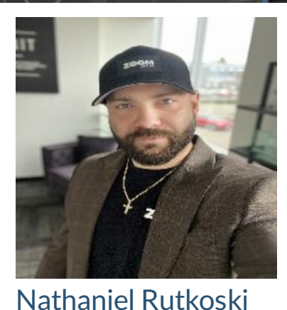
Mortgage Broker, Zoom Loans

www.ZMLoans.com M: (408) 767-6311 2140 W Grantline Rd Tracy CA 95376 NMLS# 356590