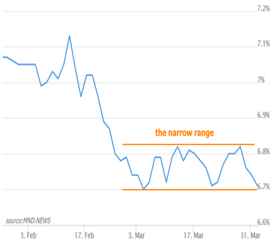
30yr Fixed Mortgage Rate Index

In other words, rates have fallen by a modest amount on each of the past 3 business days. To reemphasize the narrowness of the range, we were at the highest levels 4 days ago.