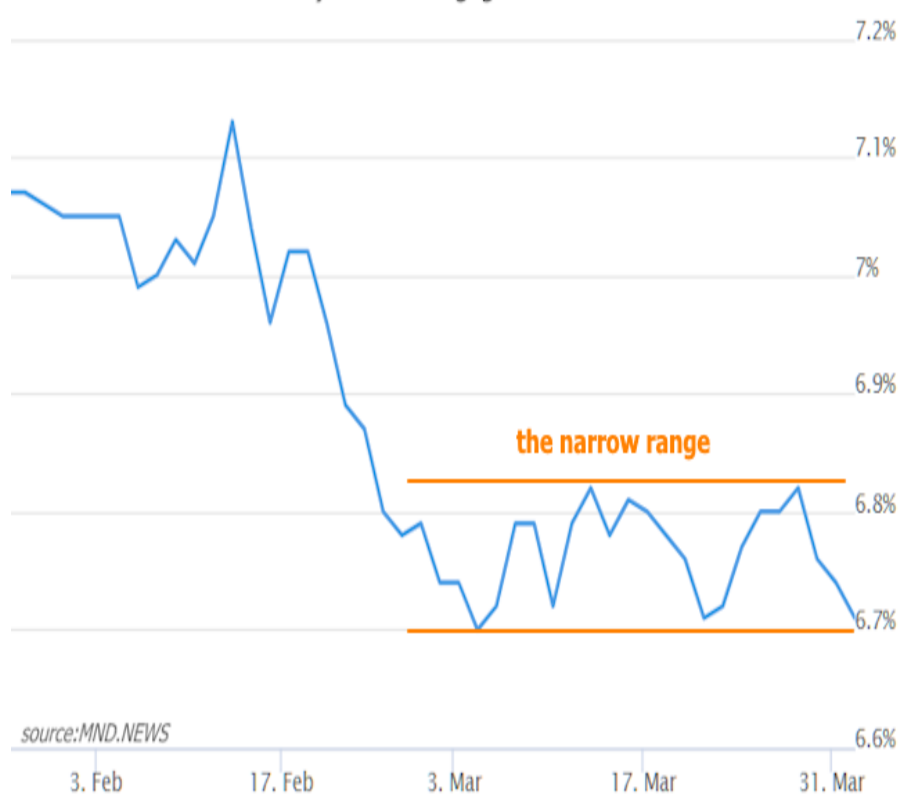
30yr Fixed Mortgage Rate Index

In other words, rates have fallen by a modest amount on each of the past 3 business days. To reemphasize the narrowness of the range, we were at the highest levels 4 days ago.