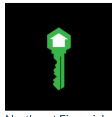
Northeast Financial LLC

www.northeast-mortgage.com P: (844) 788-7237