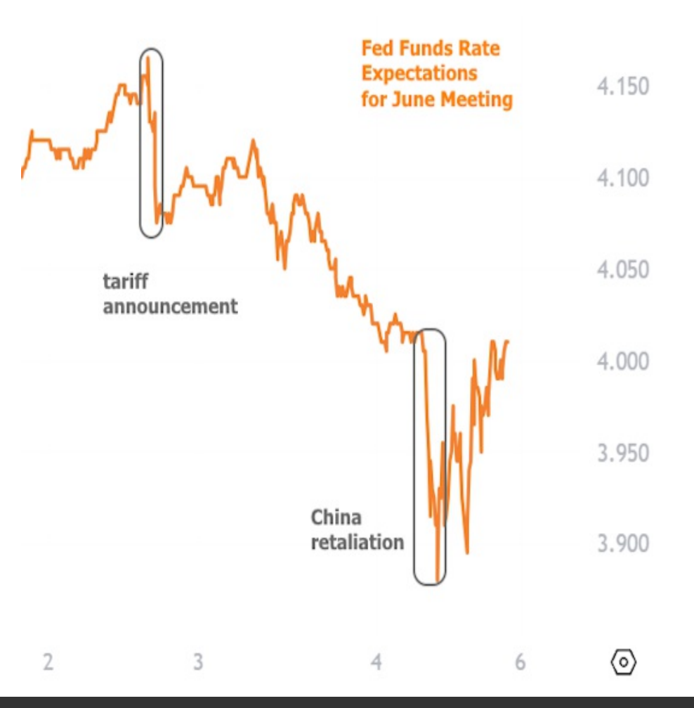
© MBS Live, LLC. All rights reserved. This newsletter is a service of MBS Live.

Part of the reaction in the interest rate market was based on the implication for Fed policy. Specifically, traders quickly began betting on a higher probability of deeper Fed rate cuts in 2025. That shift can be seen in the following chart of the market's expected Fed Funds Rate after the June meeting.