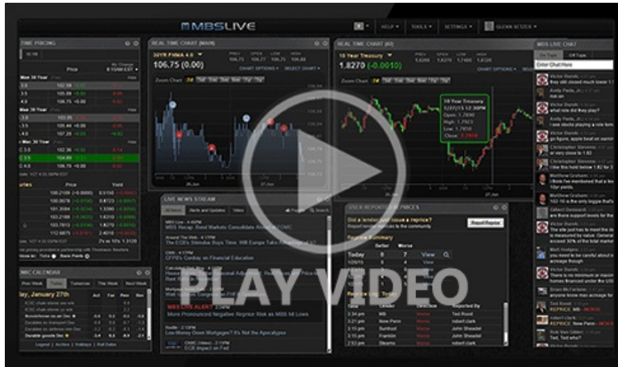
Watch the Video

Since tariffs are a big part of many of those bullet points, it makes sense to see relief in bonds after the 90 day delay, and it also makes sense that Treasuries still have some things to worry about (hence not being back to unchanged levels).