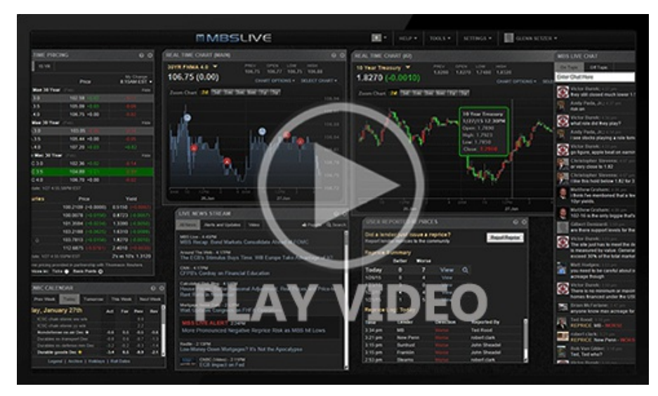
Watch the Video

Since tariffs are a big part of many of those bullet points, it makes sense to see relief in bonds after the 90 day delay, and it also makes sense that Treasuries still have some things to worry about (hence not being back to unchanged levels).