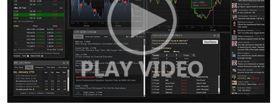
Watch the Video