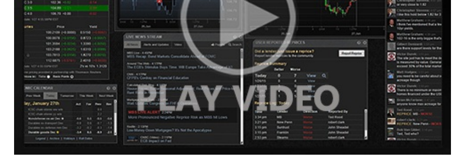
Watch the Video